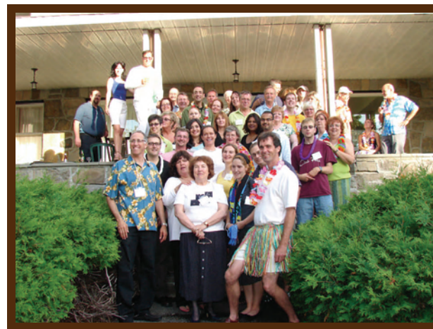
Delegates and sponsors celebrate at the 4th Annual Brain Injury Association of Canada's conference, Montreal, July 2007.